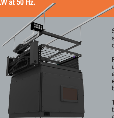
Shown with Sound Enclosure

Select Adaptive's Pro-Lift Scissor Lift System to view and stow large format DCI digital projectors from above screening rooms, auditoriums, theaters, etc. Pro-Lift Scissor Lifts are professionally engineered, easy to install, computer controlled and built to UL standards.