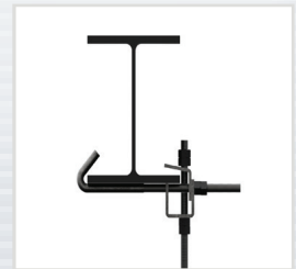
I-Beam with Clamp

This beam clamp model provides a fast, easy and safe way to rig direct loads, bridles and hitches from overhead and a hand wrench is all that is required to secure this clamp. The beam flanges must be parallel to the floor. The beam flanges must be parallel to the floor.